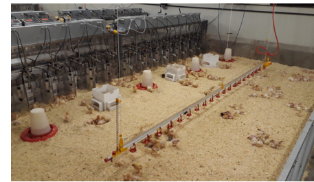
Feed station at one of Hubbard's R&D centre

To increase the accuracy of genetic selection methods, Hubbard uses the latest technology and techniques to further progress bird performance. An example is advanced 3D imaging to improve selection for skeletal health, meat yield and quality. Also, Lifetime Feed Conversion Ratio (LFCR) technology is being implemented. This is a modern method to observe FCR and feeding behaviour during a bird's lifetime in order to select birds that are the most efficient in converting feed to body weight. These additional gains in FCR made in recent years means that less feed – the single highest cost in poultry production – is needed to produce healthy and productive birds.