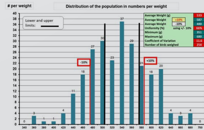
▲ Histogram with a weight interval of 20g

E.g.: If the lower limit is 500g, birds weighing 520g will be placed separately in a "buffer" pen. If the upper limit is 560g, animals weighing 580g will be set aside in this "buffer" pen.