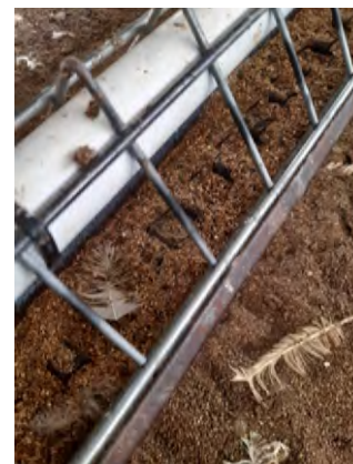
Figure 7: Tube inside the grill