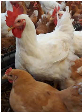
Figure 9: Good M77 attitude