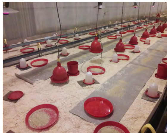
Figure 1: Good brooding conditions

>> Please consult Hubbard website or your local Hubbard Technical Manager to obtain the Hubbard Brooding Poster for more specific details.