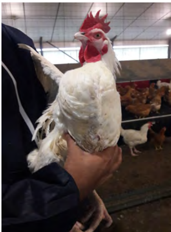
Figure 8: M99 breast condition

>> Male observation and handling is crucial to evaluate their condition (see below Figures 8, 9, 10).