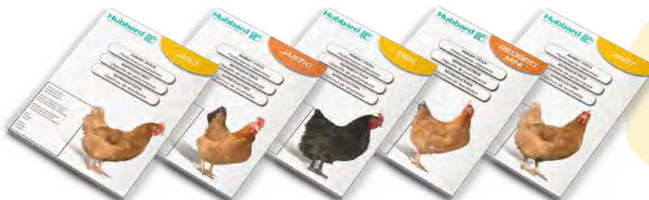
Performance Objectives JA57 - JA57Ki - P6N - REDBRO MINI - JA87