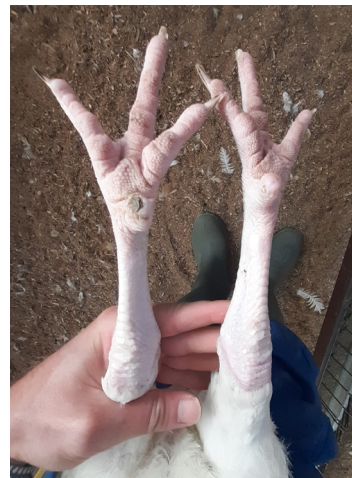
Figure 10: M99 leg condition