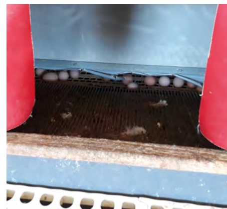
Figure 6: Nest management

>> Make daily checks for the presence of non-laying birds from the peak of lay onwards. Isolate broody hens away from nests in a pen with water and feed for one week. Please refer to The Hubbard Technical Bulletin «Broodiness».