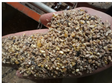
Figure 3: Too coarse feed presentation