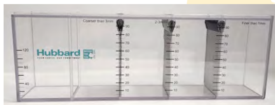
Figure 12: Hubbard Feed Sieve

>> The percentages show the guideline amount in each category of particle size after sieving with screens of 3, 2 and 1mm such as with a Hubbard feed sieve. It is important for all feeds that the percentage of feed passing through the 1mm screen does not exceed the amounts shown.