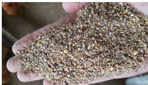
Figure 4: Good feed presentation