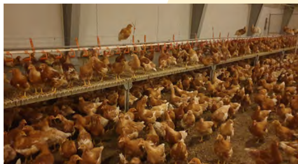
Figure 2: Example of an elevated platform

>> The use of electric wires is not recommended in the rearing house.