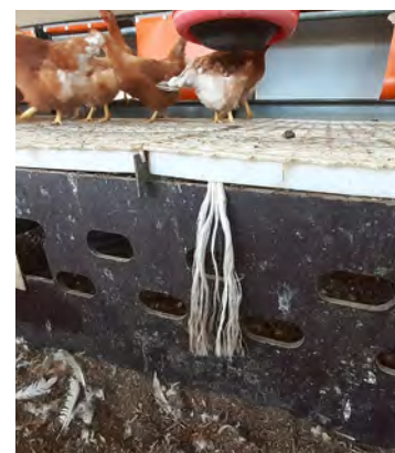
Figure 11: White strings in the production house