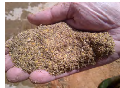
Figure 5: Too fine feed presentation